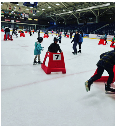
Skating field trip!

Thanks to everyone who has been able to attend our skating trips. It has been so great to have extra adults on the ice, as well as to tie all those skates! Our second skating trip is coming up this Tuesday.