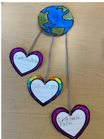
Ms. Jung's class created beautiful Earth Day murals!