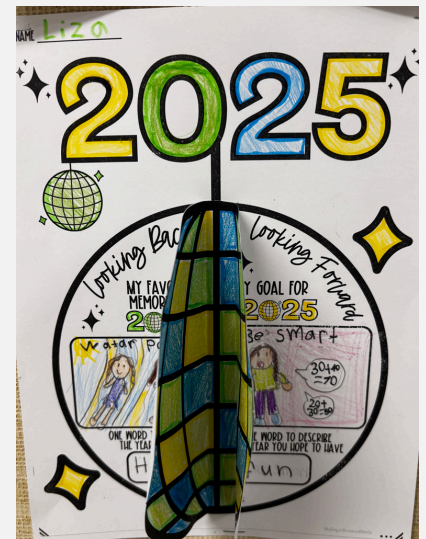
Looking back and looking forward in Ms. Jung's class!